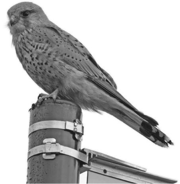
Common Kestrel - Gary Bellingham

Flints. There were seventy seven records from every month of the year, of mainly 1 or 2 birds. Three broods ringed were 3 at Shotton Paper on 26/06, 4 at Rhydymwyn on 30/06 and 2 at Sandycroft on 1/07 (IMS).